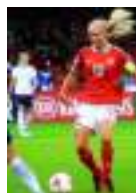
Pernille HARDER (DEN, Wolfsburg)

Who will succeed ADA : 3 players nominated :