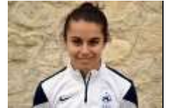
<- Juvisy, U19