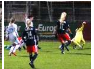
ADA (55'), corner kick Amel