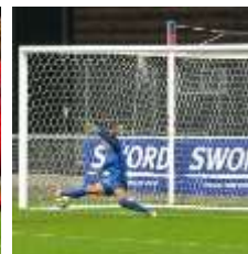
SAKI (p) (67')