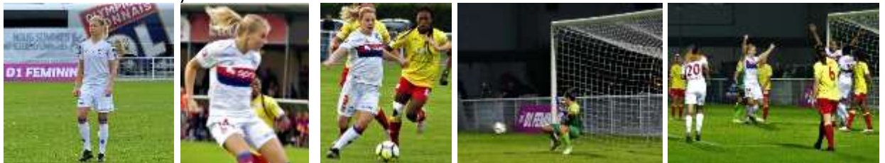
ADA (2') EUGENIE (56') SAKI (p) (68') GRIEDGE (90')