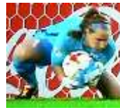
5- K.BARDSLEY Man City/ England 36 pts