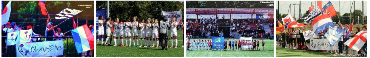
OL : 5 fr/11, 6 fr/14, 8 fr/16 - EAG : 8 fr/11, 11 fr/14, 14 fr/16