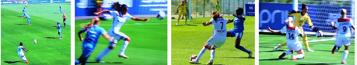
Ada (5 th )

As the first day, ADA scored quickly (after 5 minutes).