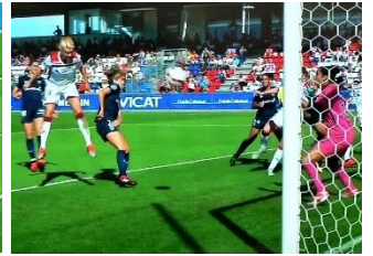
Ada (58 th )