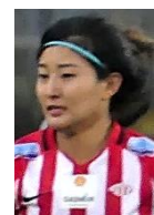
Cho So-Yun South Korea