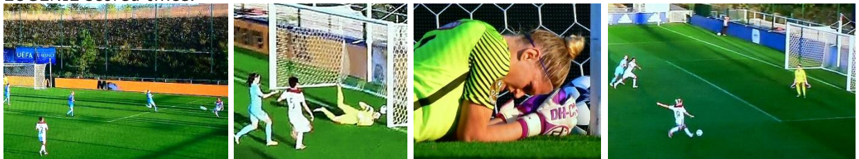
Eugénie (22 th )