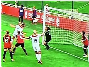
Amandine (72 nd )