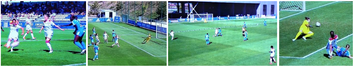
Amel (33 rd )

Great match of AMEL; a lot of activity and squares. Set up for Ada's goal and to finish 2 goals in 2 days.