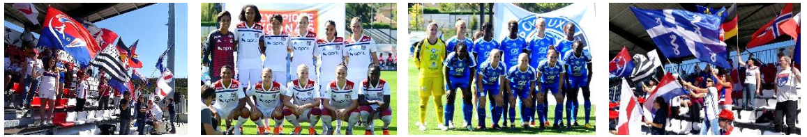
OL : 6 fr/11, 8 fr/14, 8 fr /16 - Soyaux : 10 fr/11, 13 fr/14, 15 fr/16

Second match where Charles Devineau replaced Reynald Pedros as head coach.