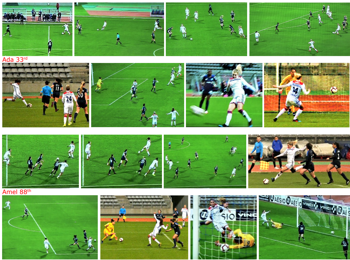
The other goal, the 3rd of 4, was an own goal by Abam under pressure from Griedge following a free kick sent in by Caro.